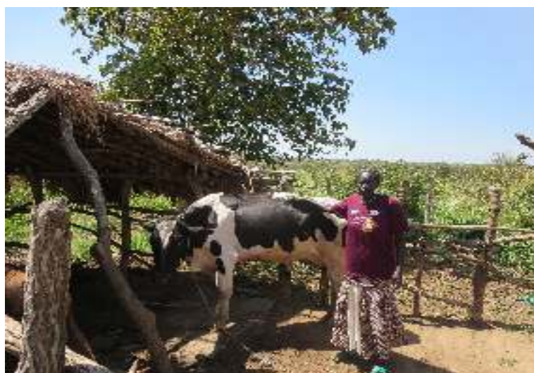
VacNet album 201.