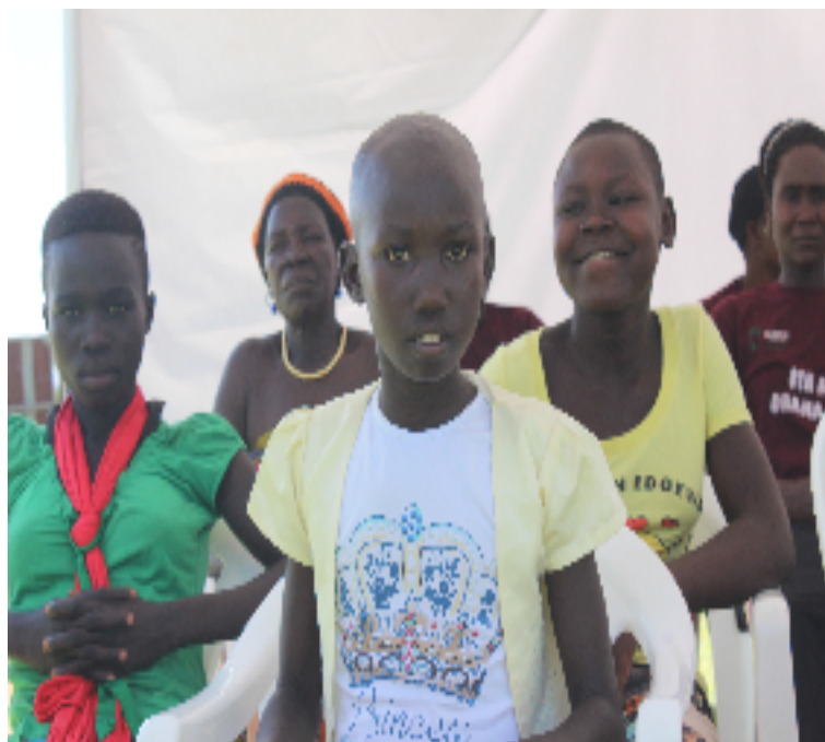
School going attentively listening to facilitator

Over 57% of schoolgirls aged 11-13 absent themselves from school due to menstrual-related challenges. The study found that around half of the girl pupils in the study report missing 1-3 days of primary school per month. This translates into a loss of 8 to 24 school days per year. This means per term a girl pupil may miss up to 8 days of study. On average, there are 220 learning days in a year and missing 24 days a year translates into 11% of the time a girl pupil will miss learning due to menstrual periods.