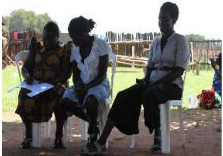
Client – Being Counseled before HIV/Aids Testing

Vac-Net with support from Civil Society Fund (CSF) successfully implemented the CAPH project in Gulu District contributing to the reduction of HIV/AIDS prevalence from 14.3 to 9%. The project addressed structural challenges and our approach was two-fold focusing on behavior, bio-medical and structural interventions reaching out to communities. 6,670 community dialogues were conducted, supported 891 commercial sex workers with alternative businesses and skills with startup capital, distributed 620,000 condoms to the sexually active, opened 122 condom distribution centers, trained and supported 138 VHTs, conducted and supported RCT and SMCs, finally mobilized and created referrals for PMCT in Gulu District.