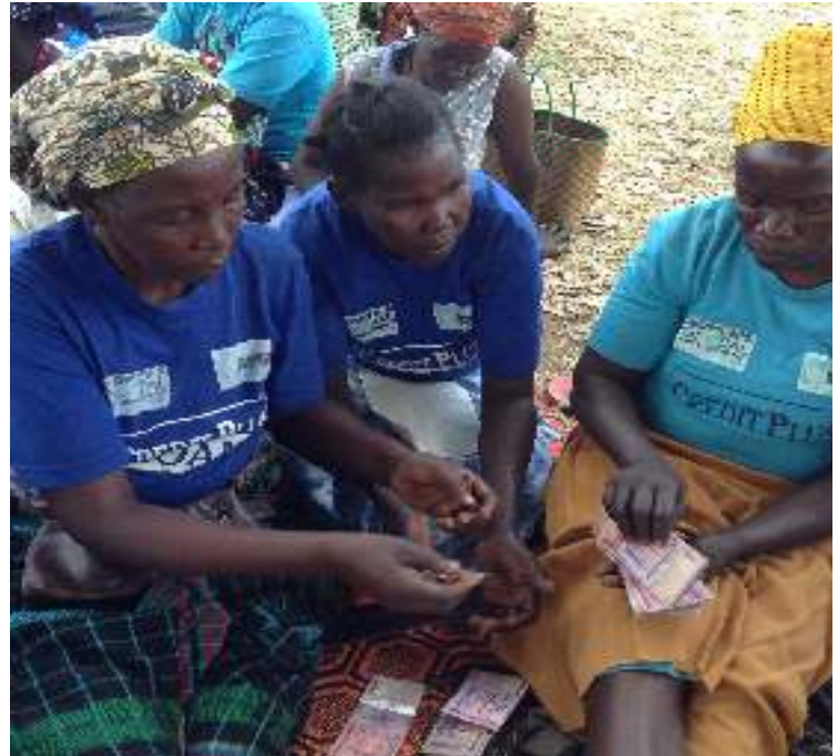
Can Opwonya Women Group- Gulu